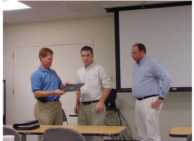
Student scholarships awarded at the April Meeting