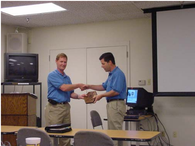
Don presents an ASHRAE Research Award

MINNEAPOLIS—Honeywell has released version EBI R310 of the Honeywell Enterprise Buildings Integrator™ (EBI) building management system. It allows building operators to view and control HVAC, security and life-safety from a local workstation or via the Web. It uses industry standards and open architecture to reduce the need to replace existing HVAC or lighting control hardware to connect disparate systems.